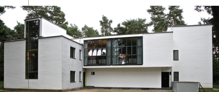
Master's House, Walter Gropius