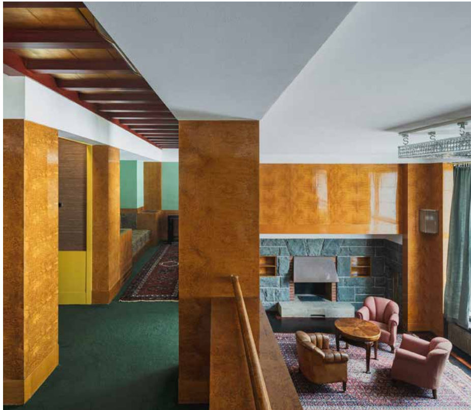
Semler Residence, Adolf Loos and Heinrich Kulka, Pilsen, Czech Republic, 1934