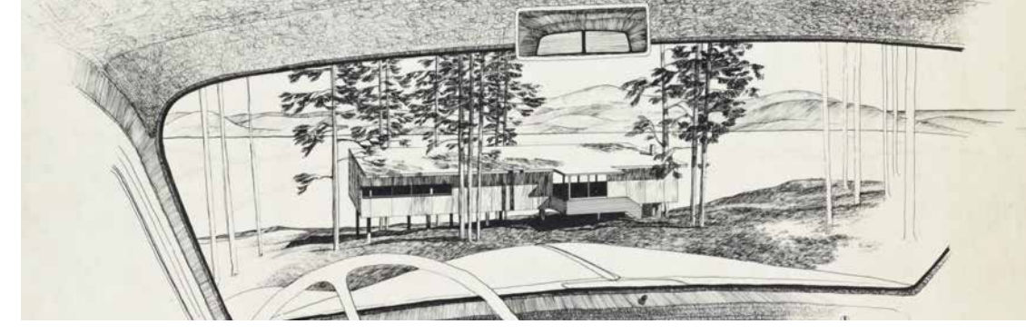
Breuer Cottage Front Perspective Through Car Windshield, 1949.